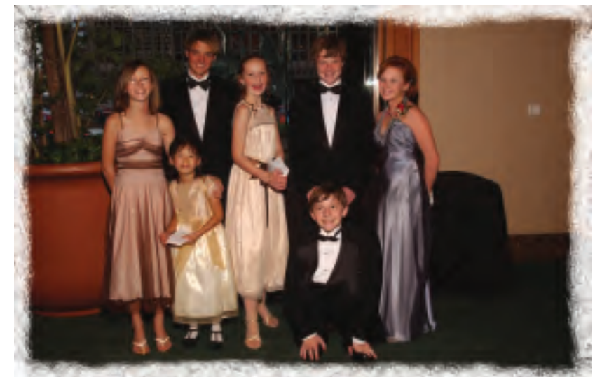
The 2006 Children's Hospital Ambassadors greeted the guests of Gala 2006 and were the real stars of the show. The Ambassador Program gives patients and former patients the opportunity to represent The Children's Hospital at premier events around the metro area. Guests at the Gala were shown a moving video featuring the 2006 Ambassadors telling their stories in their own words.