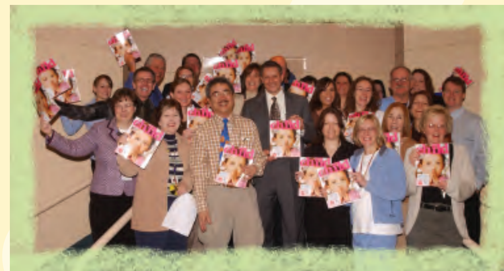
Children's Orthopedics team recently was ranked #3 in the country by Child Magazine

Healthy Child Care Colorado Initiative is a partnership between the Colorado Department of Public Health and Environment, Department of Health and Human Services: Division of Child Care, Qualistar Early Learning and The Children's Hospital. One full-time Health and Safety Nurse Consultant is contracted through The Children's Hospital School Health Program to provide statewide technical assistance and training. This position is housed at Qualistar Early Learning.