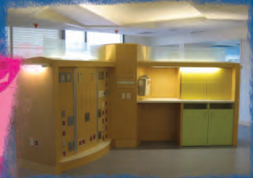
LEFT: With the exterior completed in 2006, work shifted to focus on interiors, designed to have an intense focus on how people will experience the space. Light, touch, sound, taste, scent, air, gardens and spirit are all incorporated into an effective and healing space for children and their families.