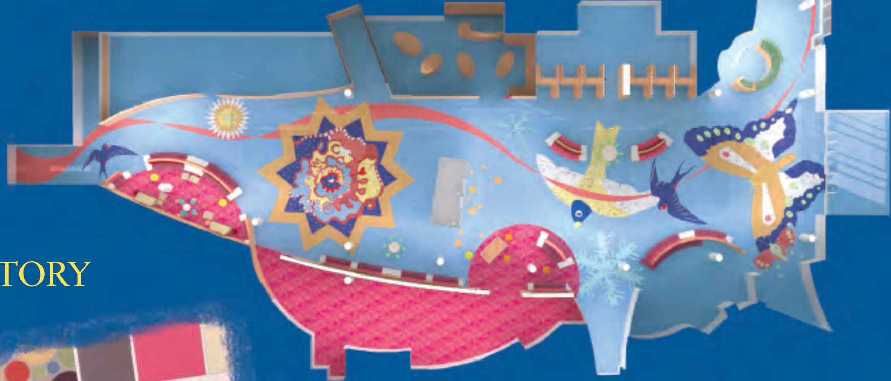
ABOVE: Dirt will be tracked in, coffee will spill, bread crumbs will fall and chewing gum will stick, but at the end of the day, the unique artwork on the floor of the Boettcher Atrium always will retain its beauty and entertain the children (and their parents!) who walk on it.