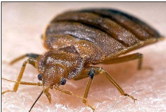
Figure 1 is a member of the insect order Hemiptera, the true bugs, with piercing-sucking mouthparts. Most bugs are winged insects adapted to sucking the sap of

The common bed bug Cimex lectularius (Figure 1)